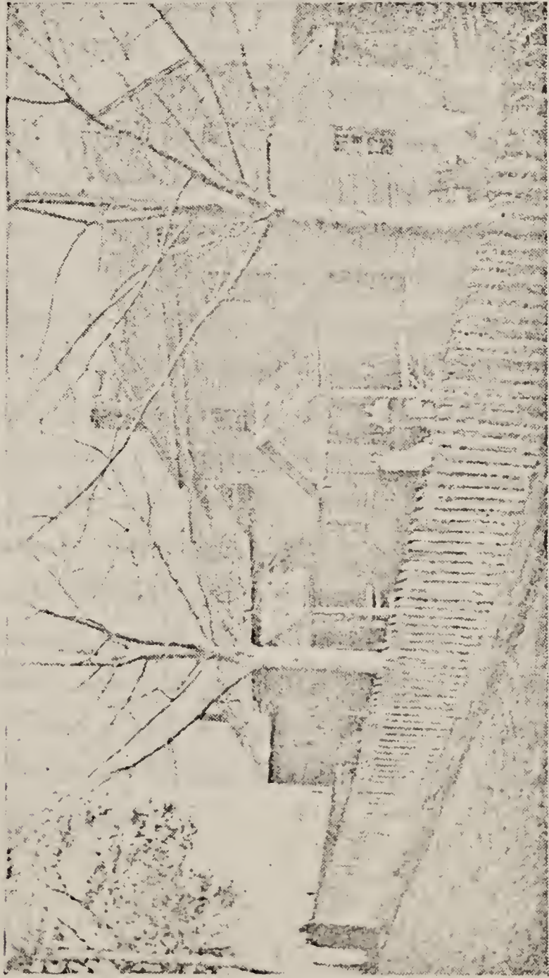
THE WILLIAM C. STOVER HOMESTEAD