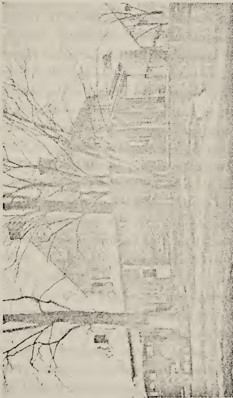
THE OLD STOVER HOMESTEAD