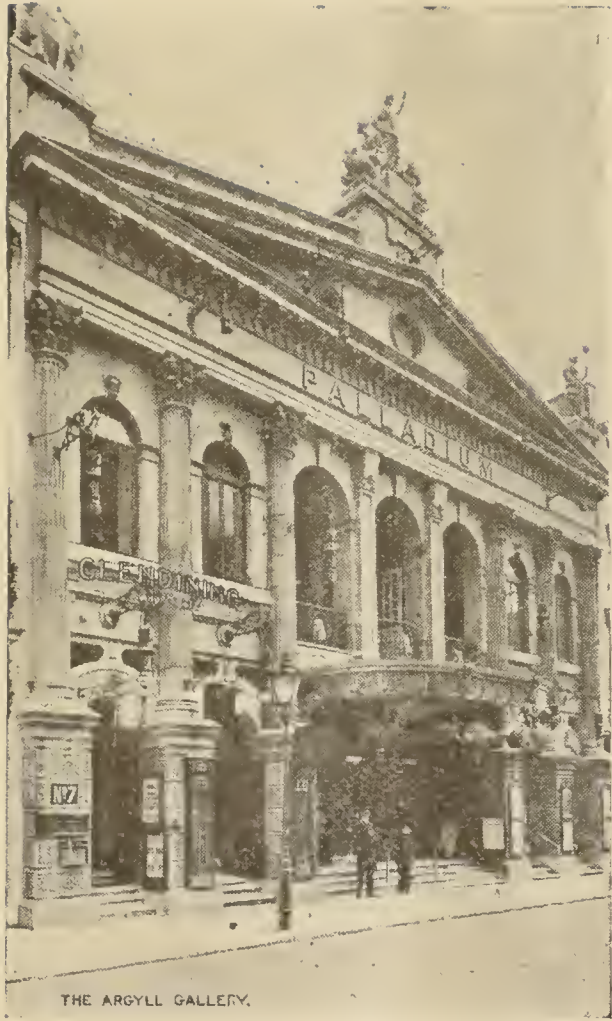
THE ARGYLL GALLERY.

THE ARGYLL GALLERIES. 7, ARGYLL STREET, OXFORD CIRCUS, W. 1.